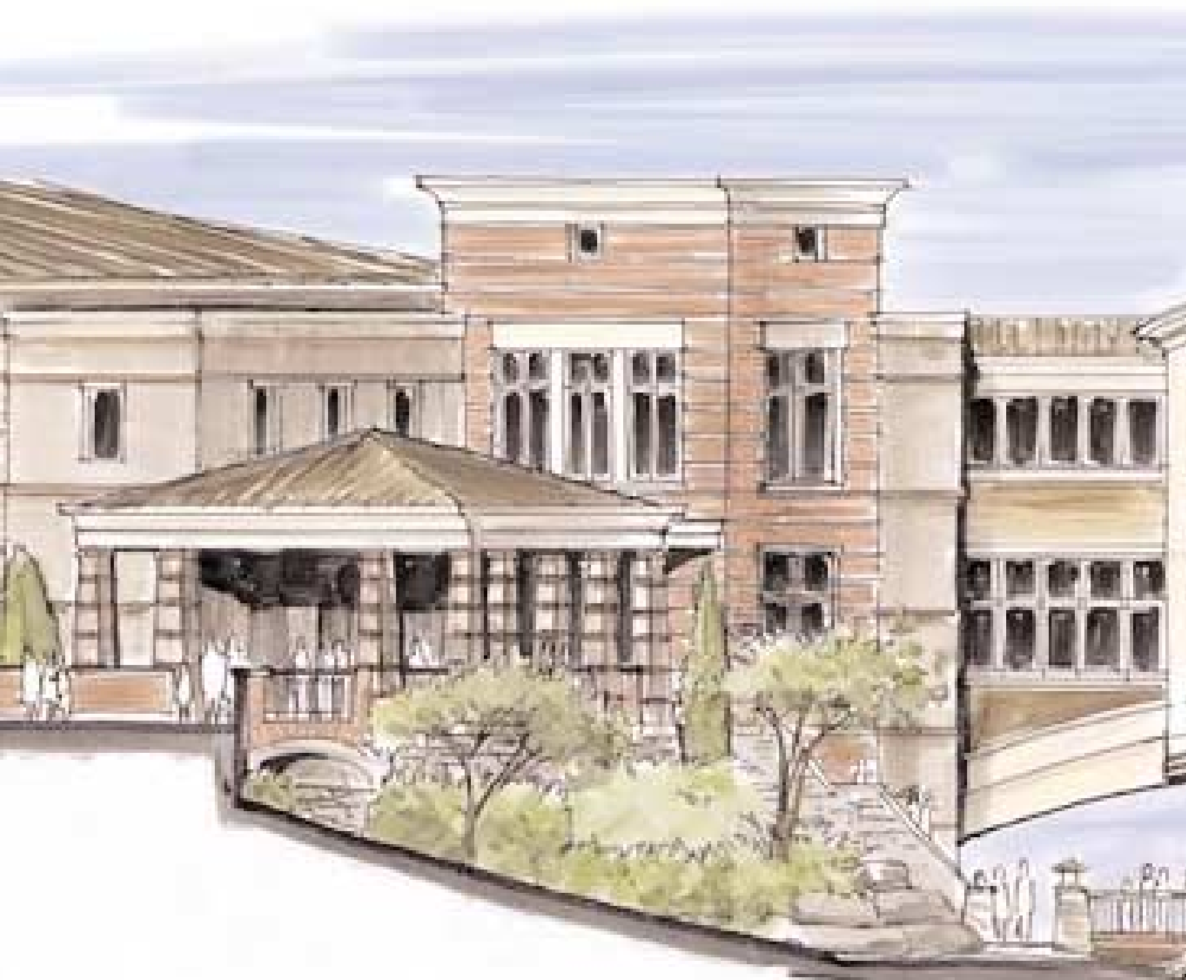
The Kindergarten Facade